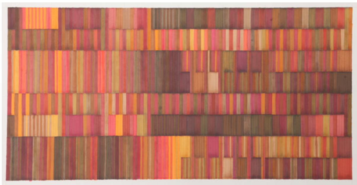
Paul Deery “Variation 14” pigmented ink on paper, 16” x 32”, 2014.

(CLINTON, NJ) -- The Hunterdon Art Museum announces its latest exhibitions.